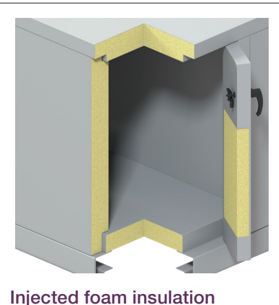
Injected foam insulation provides superior sound attenuation compared to foam board insulation

Compressor Mounting: Compressors are often mounted directly on the floor of the unit, but less sound will be radiated if the compressors are mounted off the floor. Mounting on a separate, insulated shelf within the unit is a great option to reduce sound.